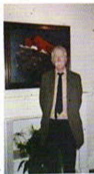
Sir Kyffin Williams OBE RA, 1991